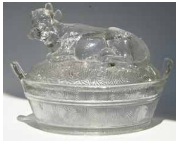
Abb. 2004-4/271 „Cow on Tub Covered Dish“ lying on a wooden wash tub Gebrüder von Streit, Hosena-Hohenbocka / Berlin um 1900 MB Streit 1913, Tafel 15, Nr. 1518, Kuhdose oval collection Feistner

Abb. 2004-3/190 „Cow on Tub Covered Dish“ lying on a wooden wash tub clear pressed glass, base H 5,5 cm, L 13,5 cm, B 10,1 cm, cover H 6,4 cm, L 11,4 cm, B 8,6 cm no signature collection Geiselberger PG-782 also collection Fehr, clear pressed glass also collection Haanstra, clear pressed glass Gebrüder von Streit, Hosena-Hohenbocka / Berlin, ca. 1900 s. MB Streit 1913, Tafel 15, Nr. 1518, Kuhdose oval