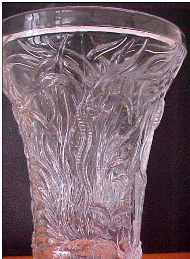
Abb. 2006-2/192 Vase „Aquarium“ farbloßes Pressglas, H xxx cm, D xxx cm Sammlung Newhall Etikett „GLASS OF BOHEMIA“ - „Libs“ in Wappen mit Krone s. MB Glassexport „Barolac“ um 1949/1952, T. o.Nr., Nr. 12110 vgl. Abb. 2006-1/311 und Abb. 2006-1/312 möglich Sklárný Libochovice, 1949 - 1990 oder noch 2006?