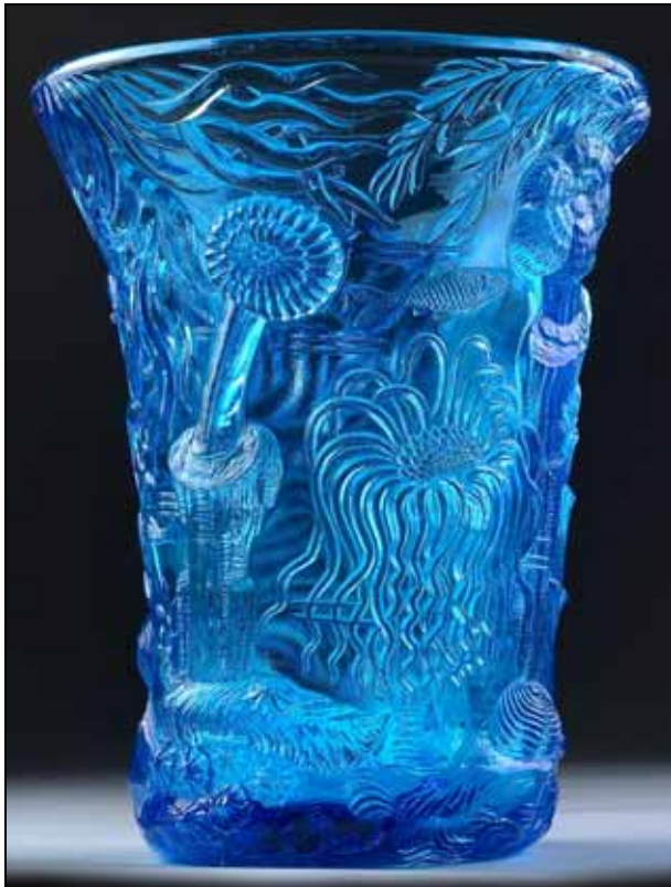
Abb. 2006-1/311 Vase „Aquarium“ blaues Pressglas, H 26,5 cm, D 19,5 cm Sammlung Weihs ohne Marke MB Glassexport „Barolac“ um 1949/1952, T. o.Nr., Nr. 12110